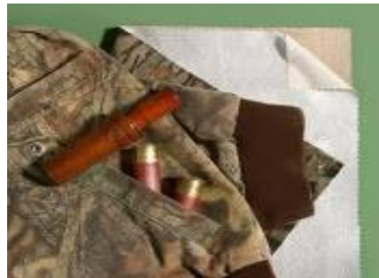
REFLECT-MET used in outdoor wear